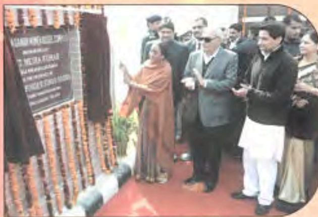
Hon'ble Speaker of Lok Sabha Smt. Meira Kumar inaugurating Kasturba Gandhi Women Hostel Complex