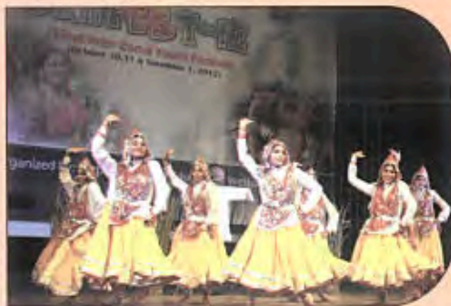
Glory of Haryanvi Culture- Dance performance in UNIFEST'2012