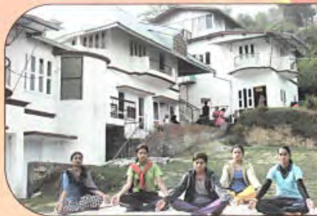
Students doing Yoga in Camp at Holiday Home, Dhanachuli(Uttarakhand)