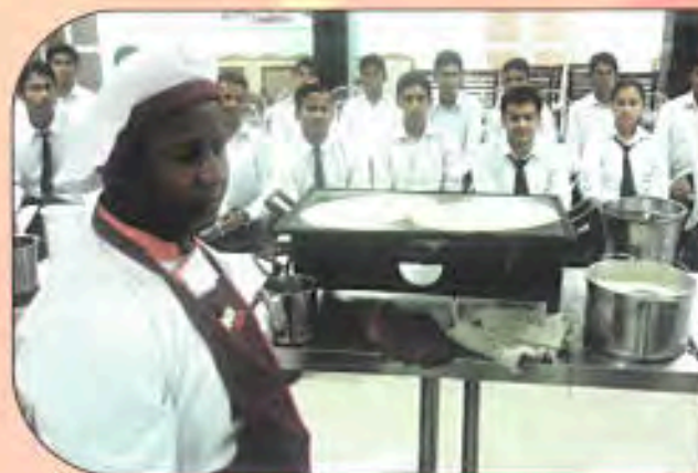
Dosa Festival in Institute of Hotel and Tourism Management