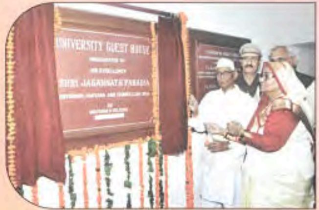
Hon'ble Governor-Chancellor Sh. Jagannath Pahadia inaugurating University Guest House