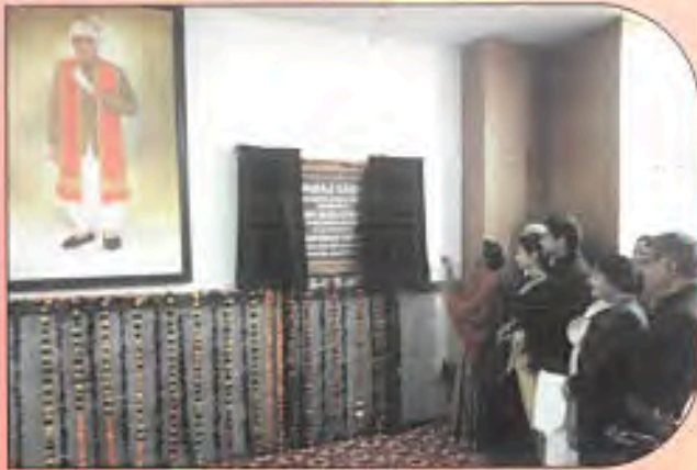
Hon'ble Speaker, Lok Sabha, Smt. Meira Kumar inaugurating Swaraj Sadan