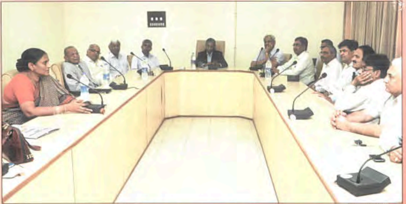
Visit of N.A.A.C. Peer Team in University