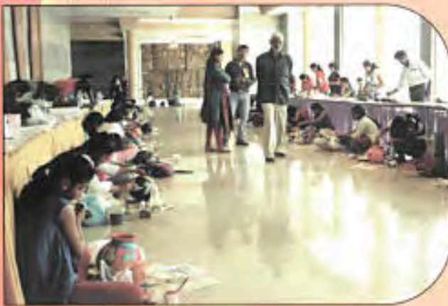
Students displaying artistic skills in Edu-fest-2013