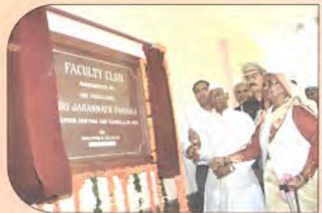
Hon'ble Governor-Chancellor Sh. Jagannath Pahadia inaugurating Faculty Club