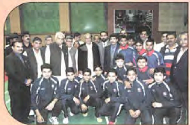
Hon'ble Chief Minister, Haryana Sh. Bhupinder Singh Hooda in All India Inter-University Badminton Championship