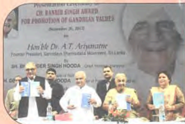
Presentation Ceremony- Ch. Ranbir Singh Award function