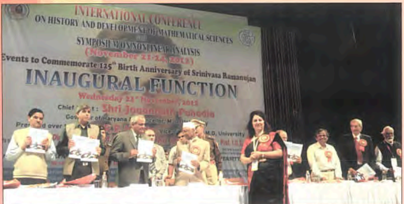
Release of Souvenir in International Conference organized by Dept. of Mathematics