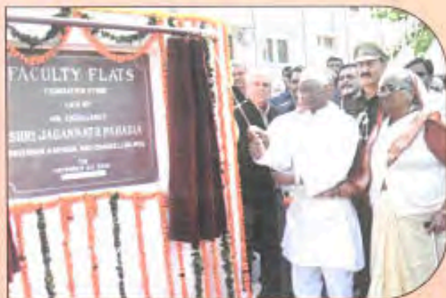
Hon'ble Governor- Chancellor Sh. Jagannath Pahadia laying the foundation of Faculty Flats