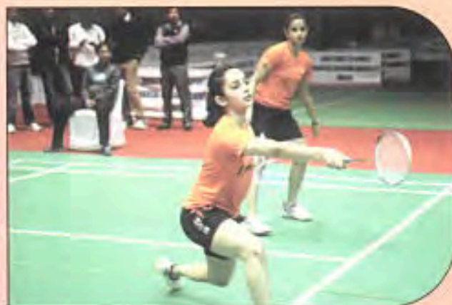
Players in action in All India Inter-University Badminton Championship